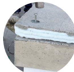
Lightweight thermal insulating plaster