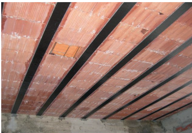
CONCRETE SLAB WITH REINFORCEMENT

Clean the remaining surface to be protected; in case of previous plasters, it is recommended a high-pressure washing or an energetic manual/mechanical brushing, followed by a deep cleaning of the support, in order to completely eliminate the intermediate layers from loose parts.