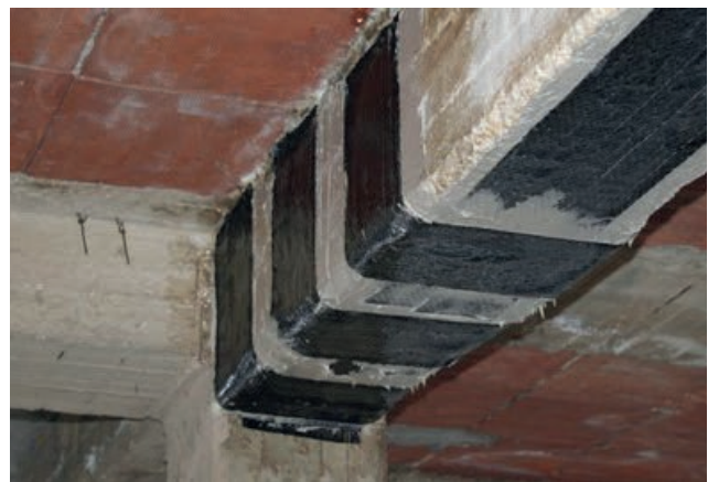
CONCRETE BEAM WITH REINFORCEMENT