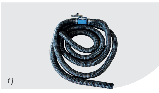
POLITERM WALL BLOW (Available for rental or purchase)