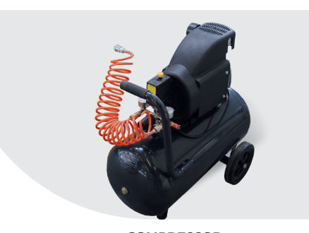
COMPRESSOR [Not supplied]